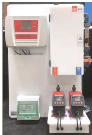
(Lutz Jesco EASYZON ClO 2 System)

In water treatment, chlorine dioxide is an effective oxidant and used, among other applications, for combating Legionella and secondary disinfection.