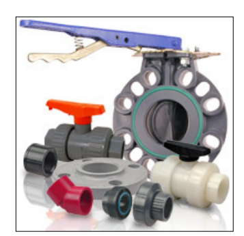
PP, and PVDF pipe, valves, and fittings, visit www.chemtrol.com.

Chemtrol is committed to superior products, technical service and support, education and training. For information on Chemtrol's quality PVC, CVPC,