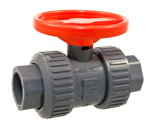
J2202 Round Safety Handles<sup>1</sup>