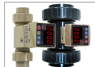
Full Face Flange Gaskets, Dry Media Throttling Valve.

For more information or to download their catalog, visit www.iconprocon.com .