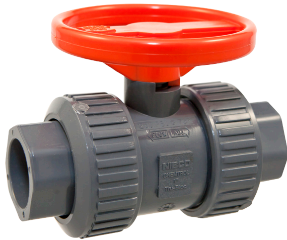
J2202 Round Safety Handles 1